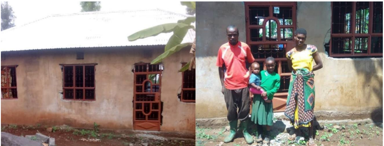
The house before work began

Work has started on their house – first steps were to reinforce the walls and add secure windows and doors.