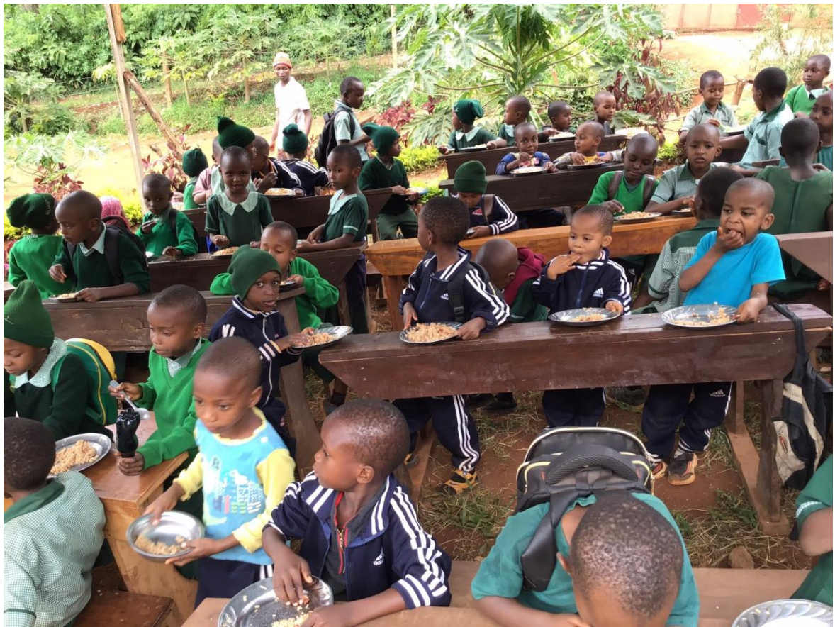
The graduating class enjoying lunch at their party

A graduation ceremony was held for the class finishing nursery in December 2020. The children received a certificate and showcased their singing skills to the school!